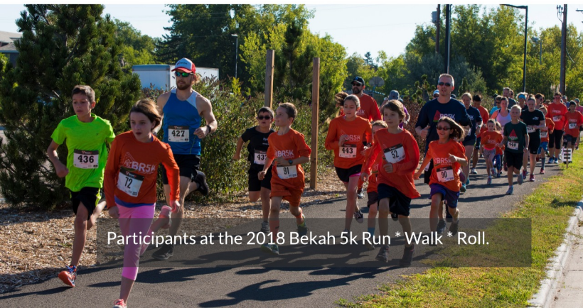
Participants at the 2018 Bekah 5k Run * Walk * Roll.

3,948 BIBLES FOR CHINESE CHRISTIANS FUNDED IN 2018. $4,059 RAISED FOR BIBLES FOR CHINA FROM THE 2018 BEKAH 5K RUN * WALK * ROLL