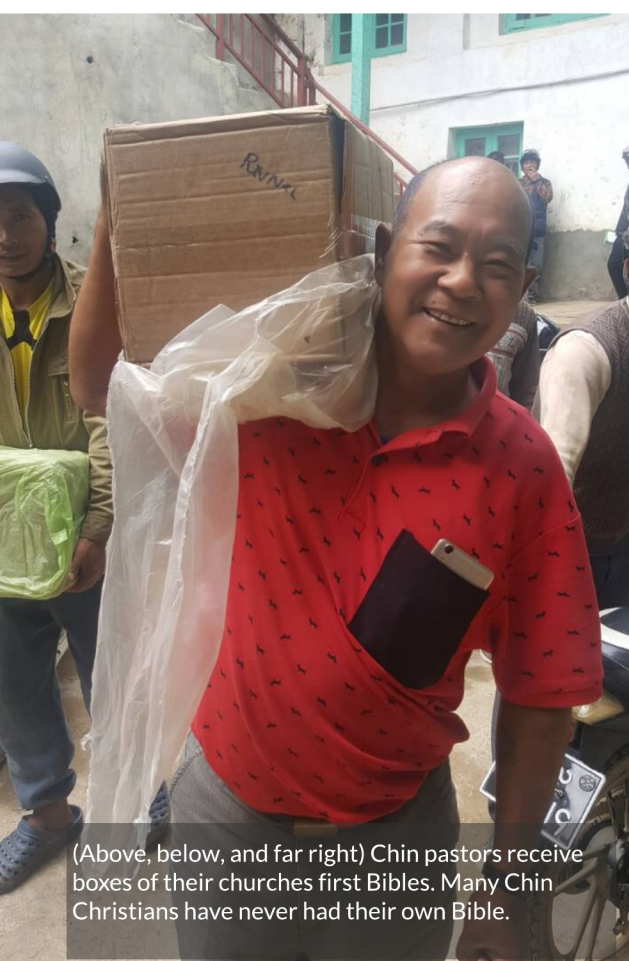
(Above, below, and far right) Chin pastors receive boxes of their churches first Bibles. Many Chin Christians have never had their own Bible.