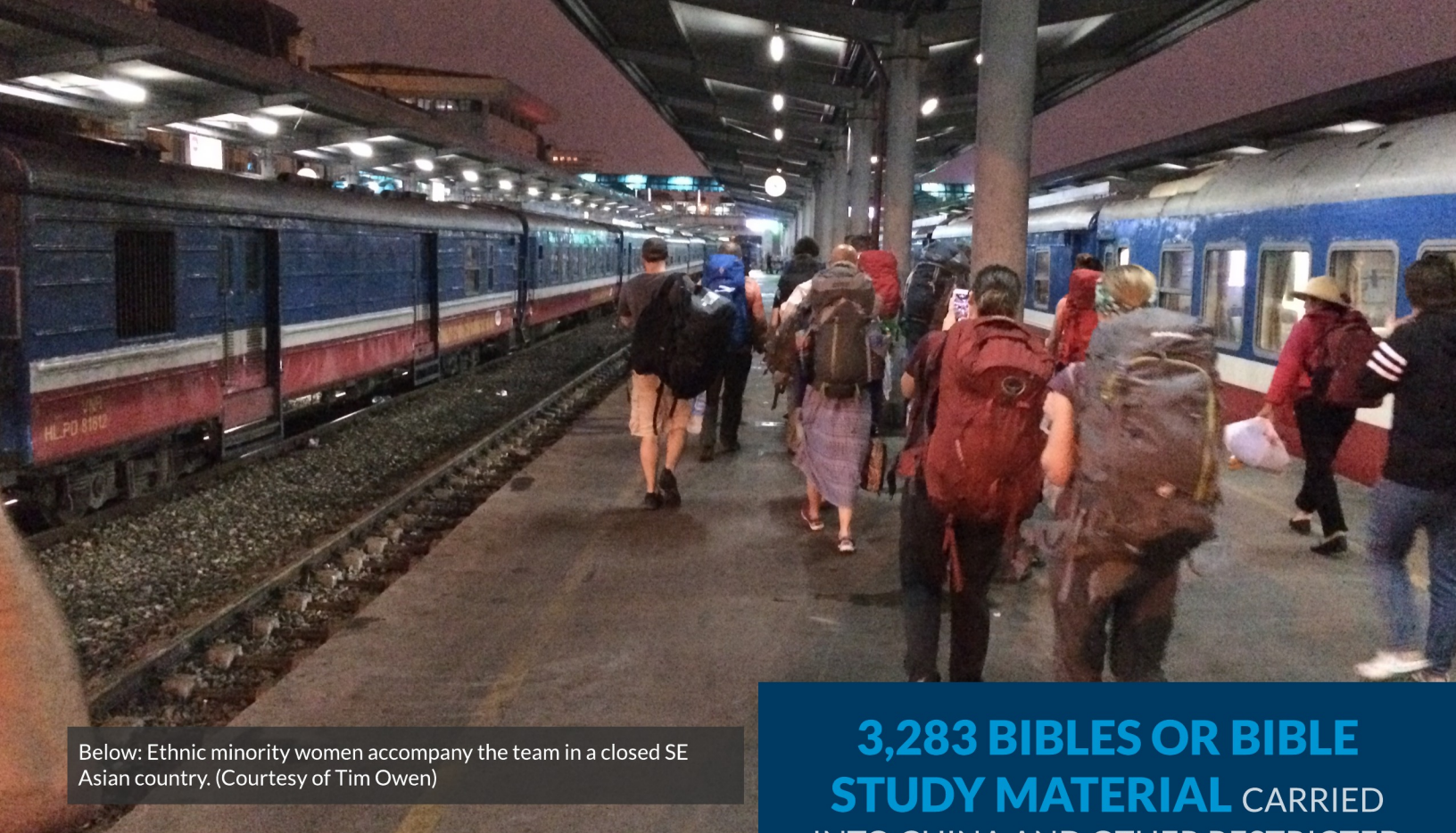
Below: Ethnic minority women accompany the team in a closed SE Asian country.

3,283 BIBLES OR BIBLE STUDY MATERIAL CARRIED INTO CHINA AND OTHER RESTRICTED COUNTRIES BY BIBLIA GLOBAL TEAMS IN 2018