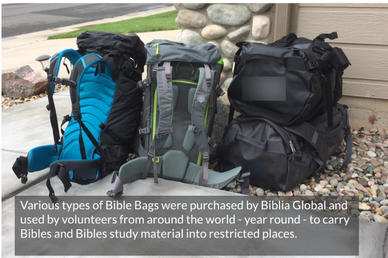
Various types of Bible Bags were purchased by Biblia Global and used by volunteers from around the world - year round - to carry Bibles and Bibles study material into restricted places.

71 VARIOUS BIBLE BAGS PURCHASED BY BIBLIA GLOBAL IN 2018 FOR CARRYING BIBLES INTO CLOSED COUNTRIES.